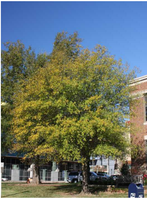
Willow Oak Quercus phellos